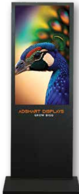
InDoor & OutDoor Digital Smart Standee.