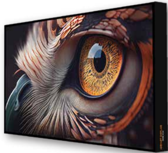
InDoor Video Wall & OutDoor Video Wall